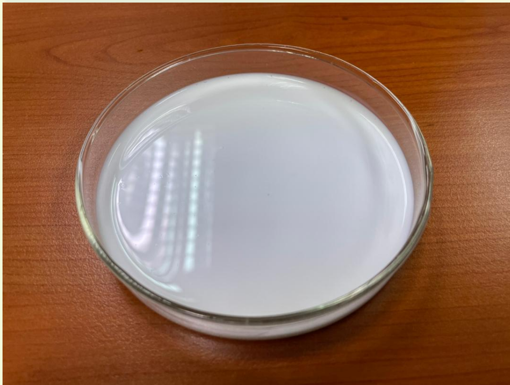
Figure A.1. Photograph of 'SUPER LATEX A-88' Test Sample