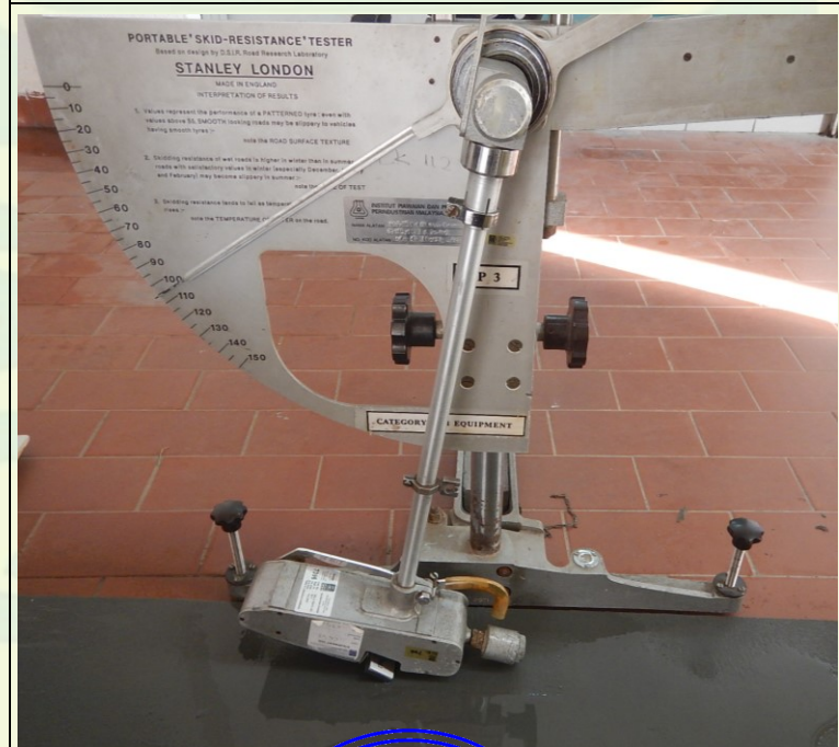
DRI-FLOOR AC 288 waterborne anti-slip acrylic floor coating at wet condition