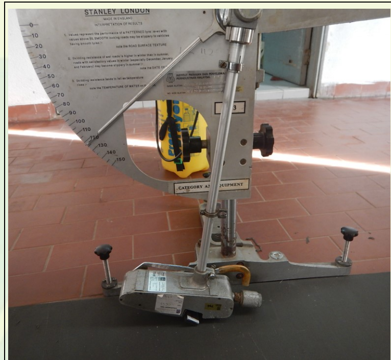
DRI-FLOOR AC 288 waterborne anti-slip acrylic floor coating tested at dry condition